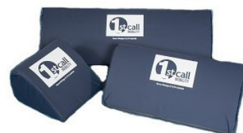
Baros Positioning Wedges